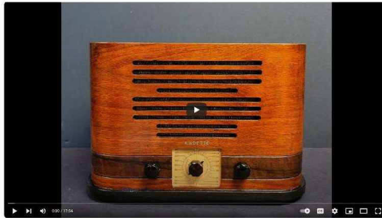
How I Do Antique Radio Wood Cabinet Refinishing